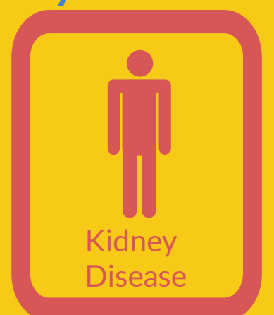
Kidney Disease It's NOT all in our genes